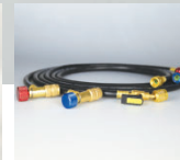
*Safe Seal hoses